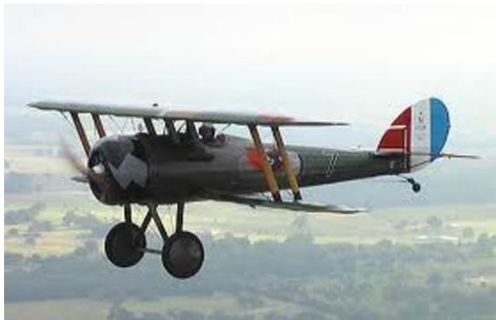
Pictured here is a Nieuport 28 World War I fighter, which will be featured in a new display for 2012.

1930s Motor Sport Magazine, loan for reference material, do not have to donate, would prefer issues pre-1950